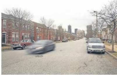
A car moves along North Ninth Street in the Cambridge Heights Apartments on March 2. Residents in the complex report the sound of gunfire and speeding cars are common in the area.

Her family recently settled a wrongful death lawsuit against Cochran Redevelopment Phase II L.P. and Cochran Redevelopment Phase II L.P., the owners of Cambridge Heights, and McCormack Baron Management, which ran it. The settlement